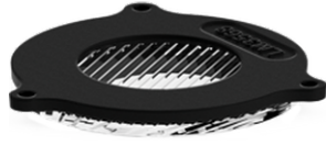
Linear spread lens A80214