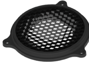
Honeycomb louvre A80121