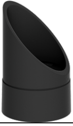
Anti-glare visor A80331