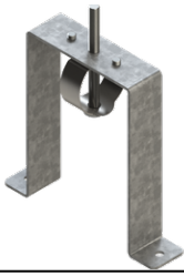
Trimless-recessed mounting bracket (60 mm Down profile) A82581