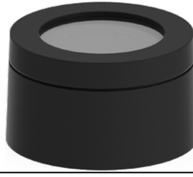
Linear spread lens A80114

Please contact the factory for technical details if you wish to use Anti-glare accessories, Colour filters, Lenses and slip glasses in combination.