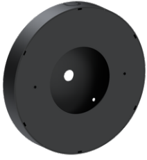
Surface mounting box for easy cabling (SANDY 6) SCE-SANDY-6