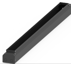
Recessing box A61051