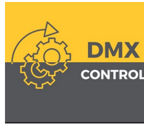
DMX Control System Control-DMX