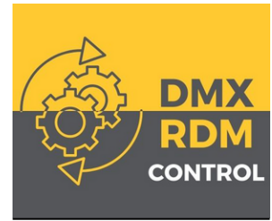
DMX/RDM Control System Control-DMX-RDM