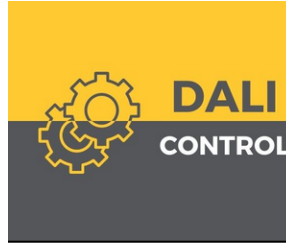
DALI Control System Control-DALI