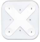
Xpress wireless switch A90591