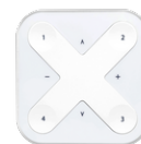
Xpress wireless switch A90591