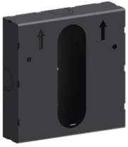
Surface mounting box for easy cabling (ABACUS 6) SCE-ABACUS-6