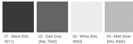
01 - Black (RAL 9011) 02 - Dark Grey (RAL 7043) 03 - White (RAL 9003) 05 - Matt Silver (RAL 9006)