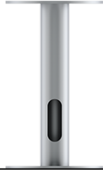
Root mount kit A20791