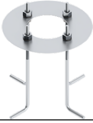
Anchor bolt A10391