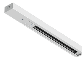
Integrated track - 3 phase - On- off for NYBRO A81391