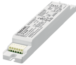
Emergency module - 250V - SELF-TEST EM250V-ST