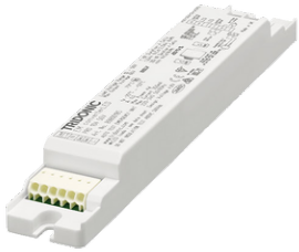
Emergency module - 250V - PRO-DALI EM250V-DA