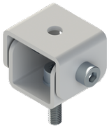
Ceiling-mounting bracket A81281