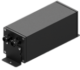
Remote box IP65 A61851