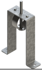
Trimless-recessed mounting bracket (40 mm Down profile) A82481