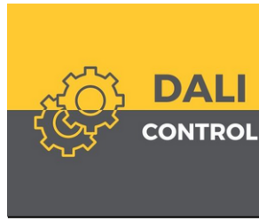
DALI Control System Control-DALI