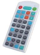
Remote controller for the motion sensor - 1-10V A14291