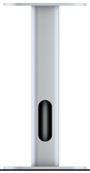
Root mount kit A21191