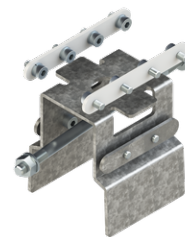
Continuous-coupler bracket A81781