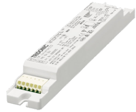
Emergency module - 250V - PRO-DALI EM250V-DA