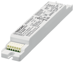
Emergency module - 250V - SELF-TEST EM250V-ST