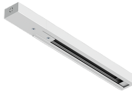
Integrated track - 3 phase - On- off for NYBRO A81391