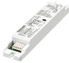
Emergency module - 250V - BASIC EM250V-BA