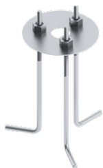
Anchor bolt A10791