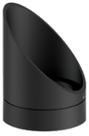
Anti glare visor A54431