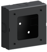
Surface mounting box for easy cabling (JET 40) SCE-JET-40