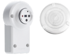
Motion sensor - PIR - 1-10V - Up to 12 m A90191-L7