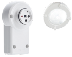
Motion sensor - PIR - 1-10V - Up to 3 m A90191-L2