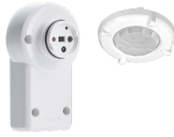
Motion sensor - PIR - 1-10V - Up to 6 m A90191-L3