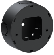
Surface mounting box for easy cabling (JET 39) SCE-JET-39