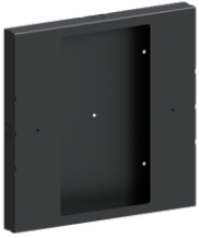
Surface mounting box for easy cabling (PALETTA 3) SCE-PALETTA-3