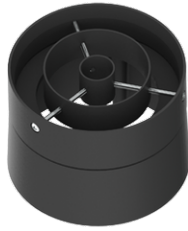
Anti glare louvre A54531