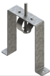
Trimless-recessed mounting bracket (60 mm Down profile) A82581