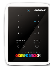
STICK-KE1, DMX Controller 1024 CH A60791