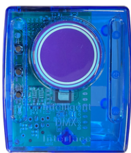
SLESA-U9, DMX Controller 256 CH A60491