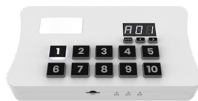
SLESA-U11, DMX Controller 1024 CH A66891