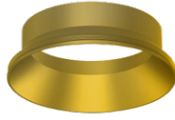
Anti-glare ring A80010