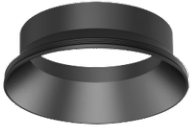
Anti-glare ring A80009