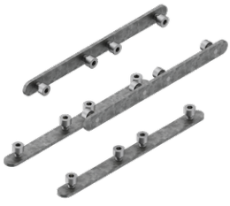
Continuous-coupler bracket (60/70 mm Down & 60 mm Down & Up profile) A81581