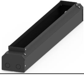
Recessing box A60951