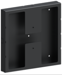
Surface mounting box for easy cabling (PALETTA 5) SCE-PALETTA-5