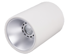
Trim - Surface cylinder (White) A80001-C135W