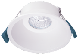
Trim - Deep recessed (White) A80001-M3W