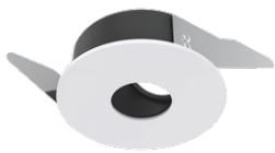
Trim - Pin hole IP44 (White) A80001-D4W