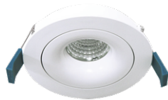
Trim - Shallow directional (White) A80001-M7W