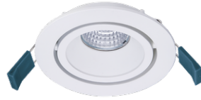
Trim - Deep recessed directional (White) A80001-M5W