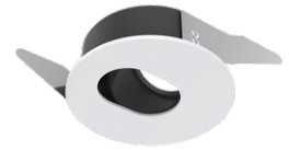
Trim - Key hole IP44 (White) A80001-D5W