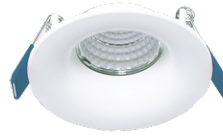
Trim - Curve recessed (White) A80001-M8W