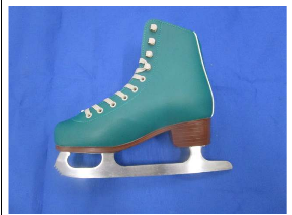
Sample as Received