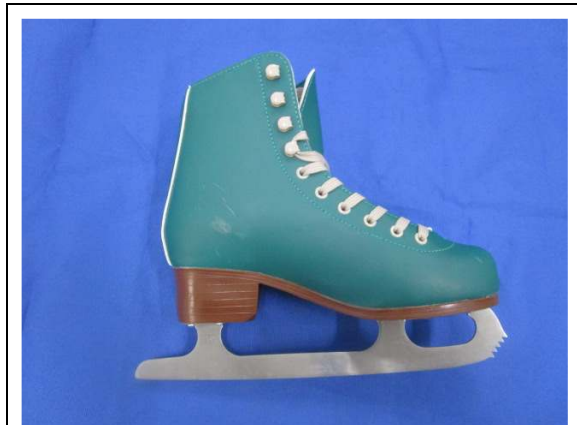
Sample as Received