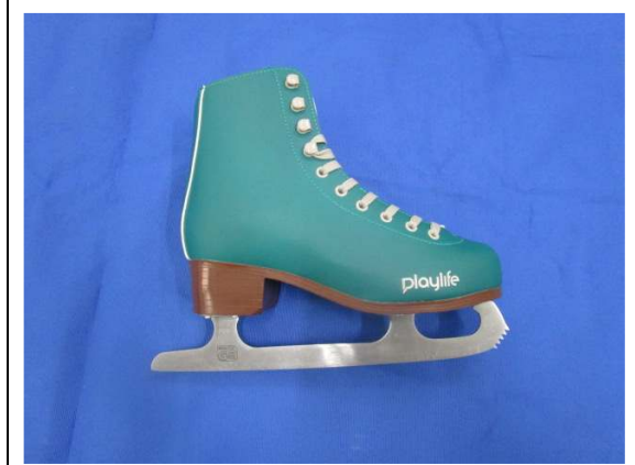
Sample as Received