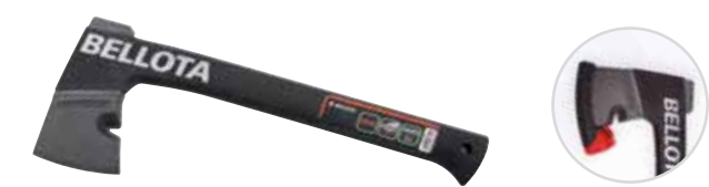
► GARDEN LINE AXE 3480