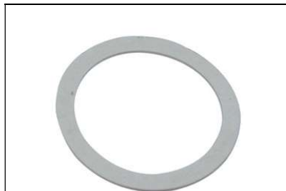
Bag of 10 heater O ring