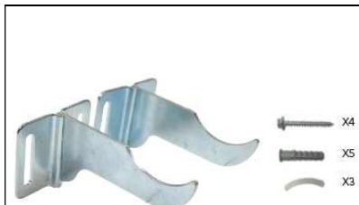
2 heater supports