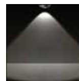
Light effect with 80° lens