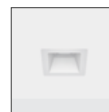
Finish in white colour