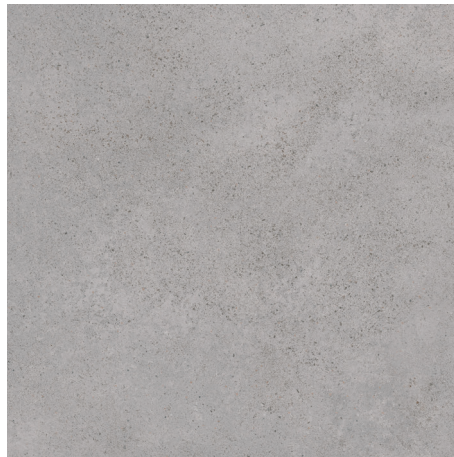
Concrete Dark | Solid Dark