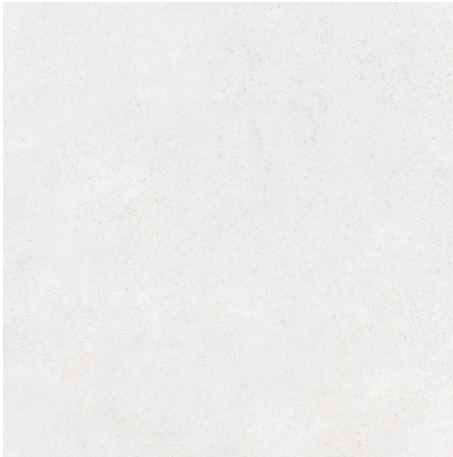
Concrete Light | Solid Light

120x120 cm/48"x48" + 90x90 cm/36"x36" + 60x120 cm /24"x48" + 60x60 cm/24"x24" + 30x60 cm/11.8"x24"