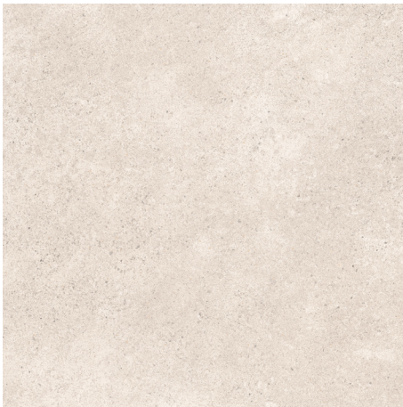
Concrete Cream | Solid Cream