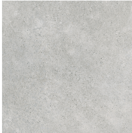
Concrete Grey | Solid Grey