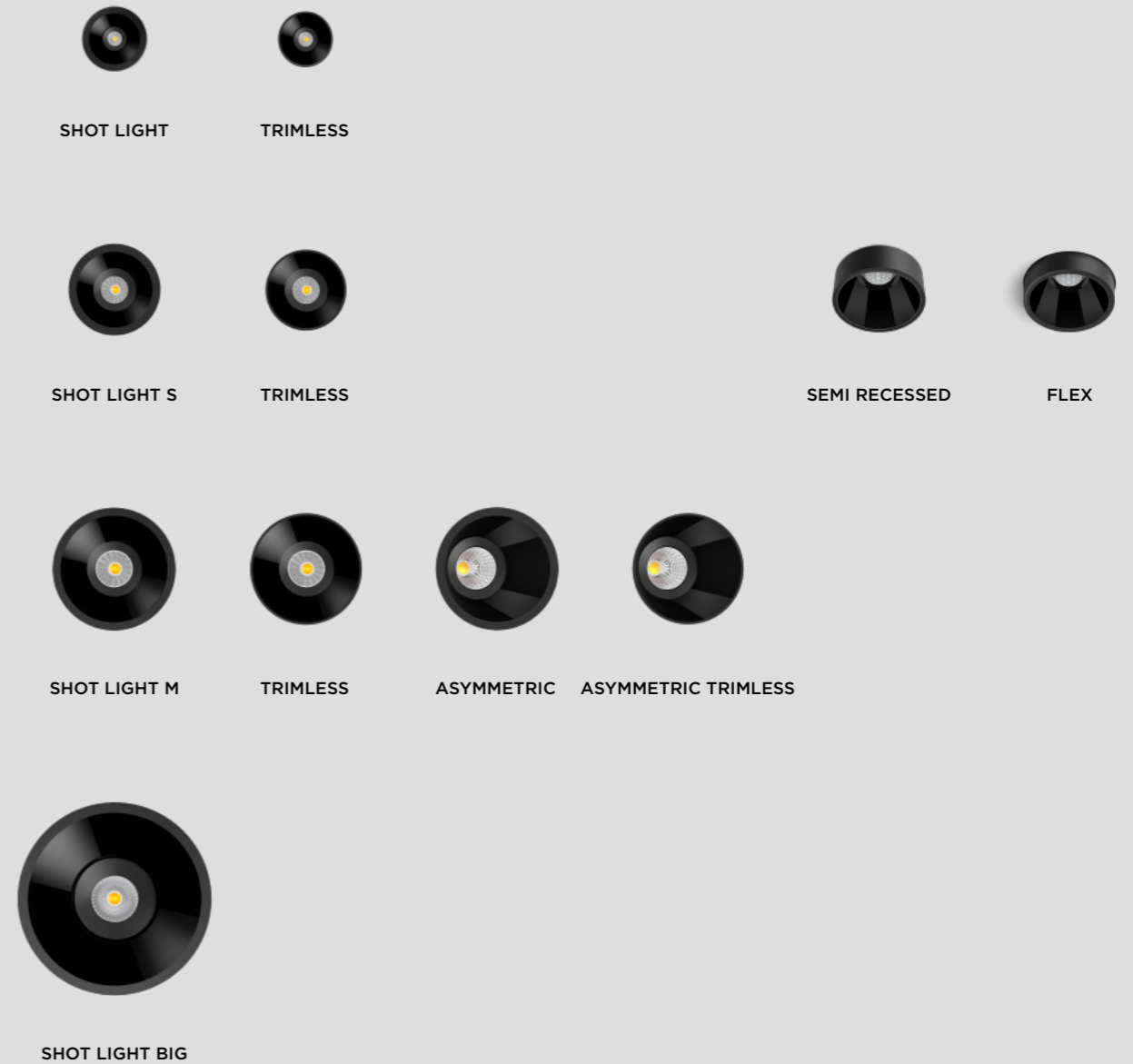
Visual representation of the products