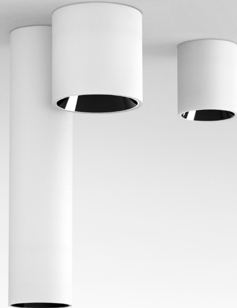
Visual representation of the products

References to any relevant websites for more information or explanatory materials, if applicable: https://www.arkoslight.com/