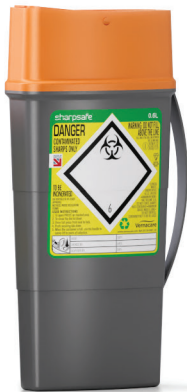
Imagery not to scale

The pocket range is designed to fit neatly into a bag or pocket for safe sharps disposal whilst in the community.