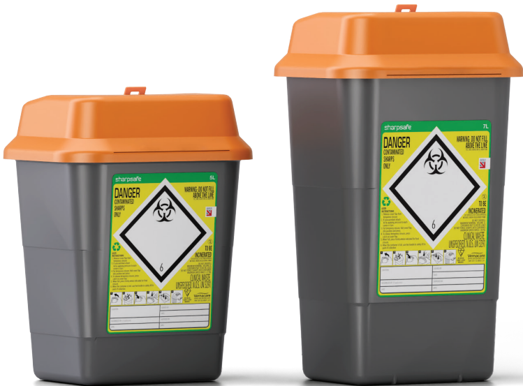
Imagery not to scale

The new medium range is designed to maximise capacity in a small footprint for acute areas. With innovative safety features such as the Dual Protect Pro™ these containers are designed to help minimise the risk of sharps injuries, whilst lowering their impact on the environment.