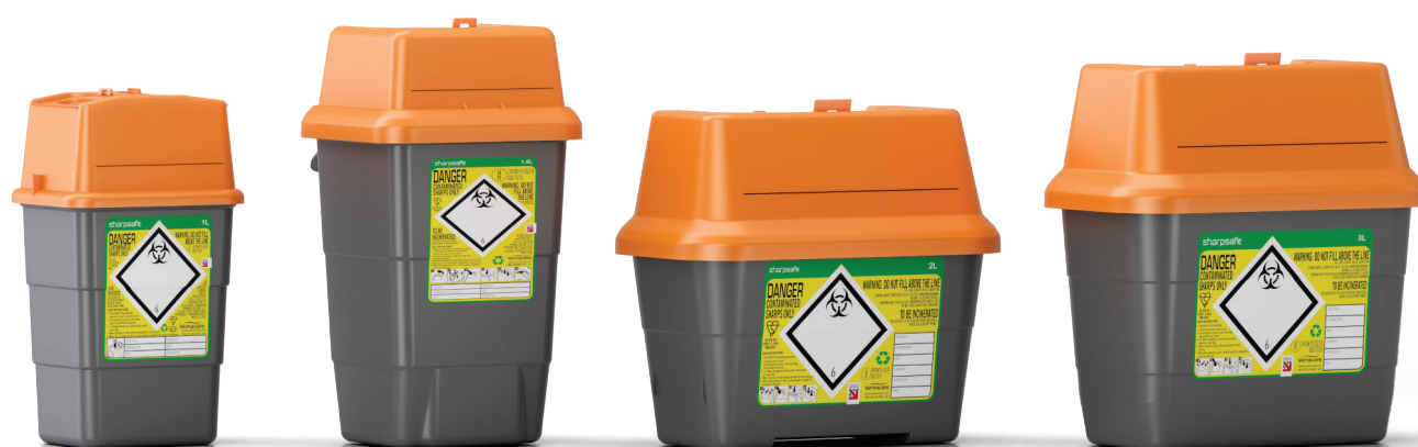
Imagery not to scale

The small range is perfectly designed to help with the safe disposal of sharps in the community and acute settings. Compatible with a range of accessories to help minimise the risk of sharps injuries at the point of use.