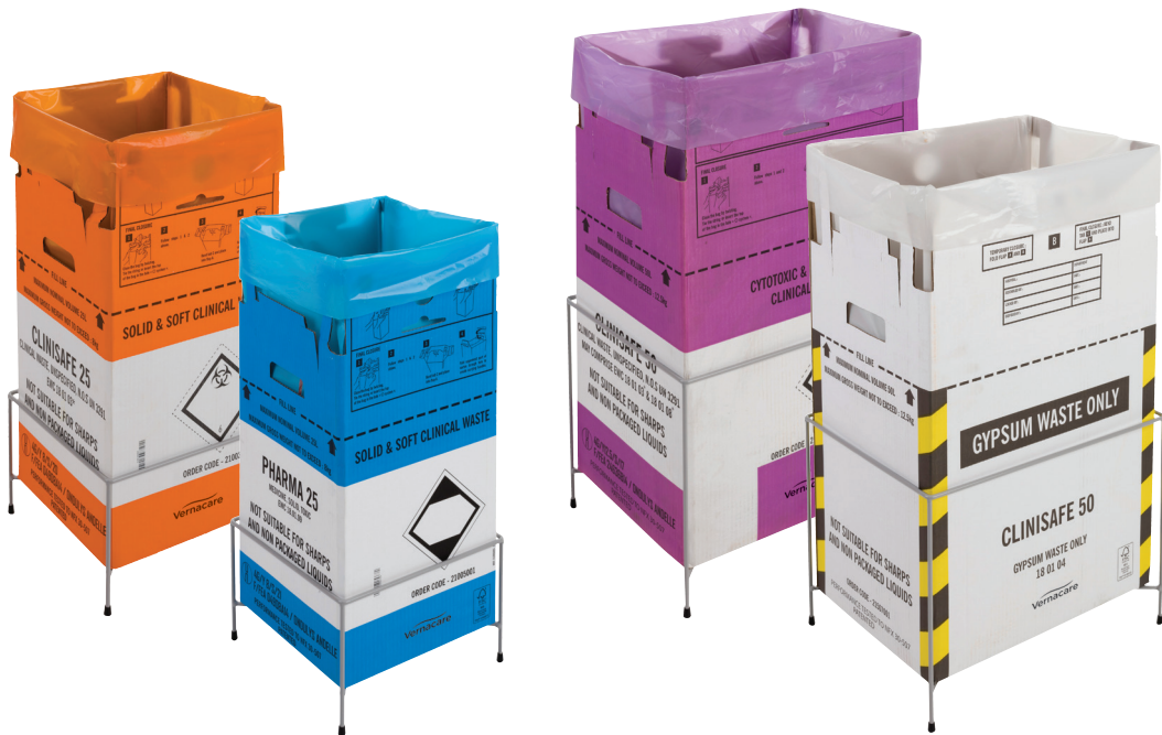
Imagery not to scale

The Clinisafe® cardboard range offers a sustainable solution to the management of clinical waste.