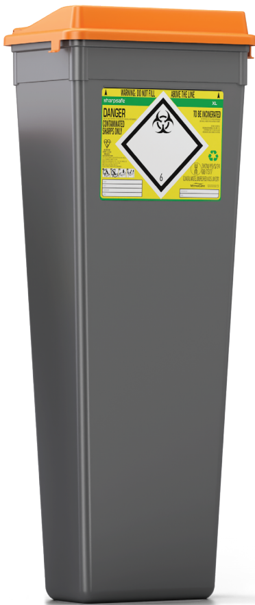
Imagery not to scale

The specialist range is designed to store and dispose of larger sharp instruments within a theatre environment. For guarantee of stability all containers in this range must be used with their accompanying reusable accessory.