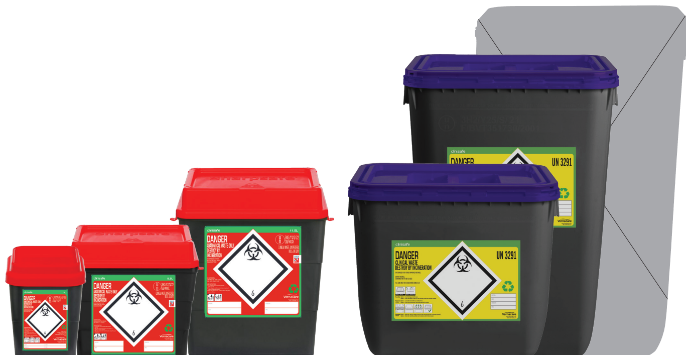
Imagery not to scale

Available in small, medium and large sizes, the Clinisafe® container range offers a solution for the disposal of clinical waste within most healthcare settings.