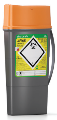
Imagery not to scale

The pocket range is designed to fit neatly into a bag or pocket for safe sharps disposal whilst in the community.