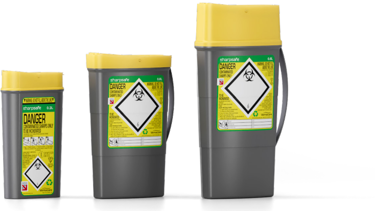
Imagery not to scale

The pocket range is designed to fit neatly into a bag or pocket for safe sharps disposal whilst in the community.