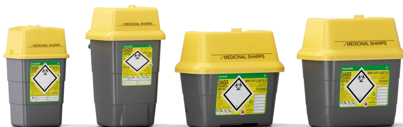
Imagery not to scale

The small range is perfectly designed to help with the safe disposal of sharps in the community and acute settings. Compatible with a range of accessories to help minimise the risk of sharps injuries at the point of use.