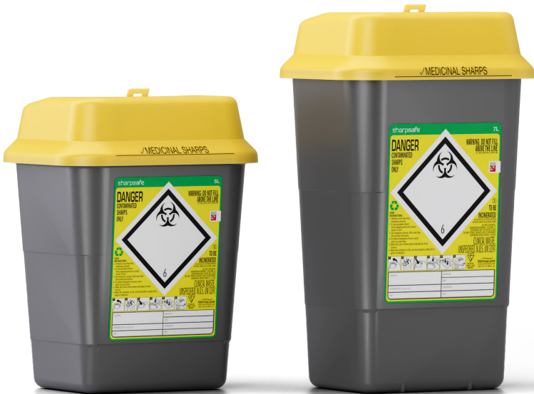
Imagery not to scale

The new medium range is designed to maximise capacity in a small footprint for acute areas. With innovative safety features such as the Dual Protect Pro™ these containers are designed to help minimise the risk of sharps injuries, whilst lowering their impact on the environment.