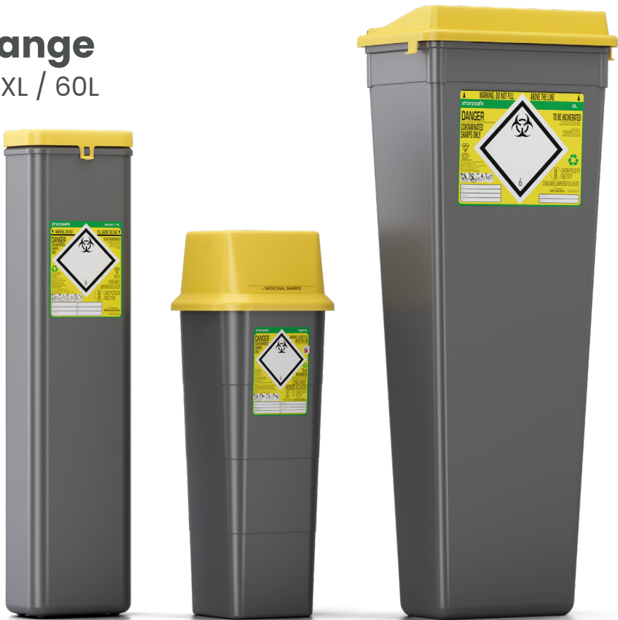
Imagery not to scale

The specialist range is designed to store and dispose of larger sharp instruments within a theatre environment. For guarantee of stability all containers in this range must be used with their accompanying reusable accessory.