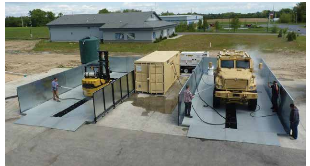
Typical application of Water Blaster with dual wash bays

The Water Blaster is ideal for pre-wash operations where it automatically draws water from a collection pit, filters it through an inline strainer and sends it back to the Water Blaster for reuse in knocking off caked-on mud.