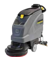
B 40 W WITH D 51 HEAD